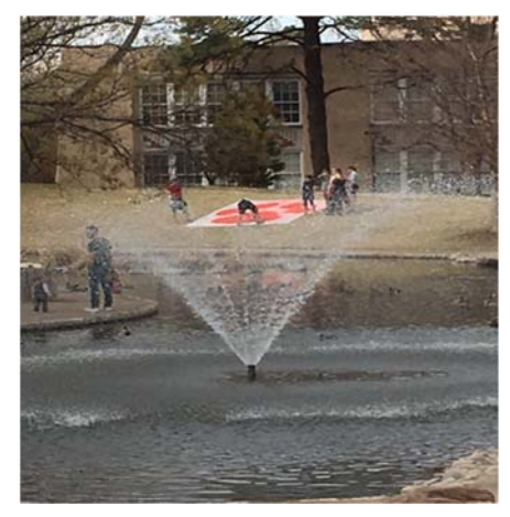
UNM students uses large stencils to create Lobo paws at the Duck Pond.

This student group worked with PPD's Grounds & Landscaping to gain approval to use this turf paint specially formulated for use on lawns.