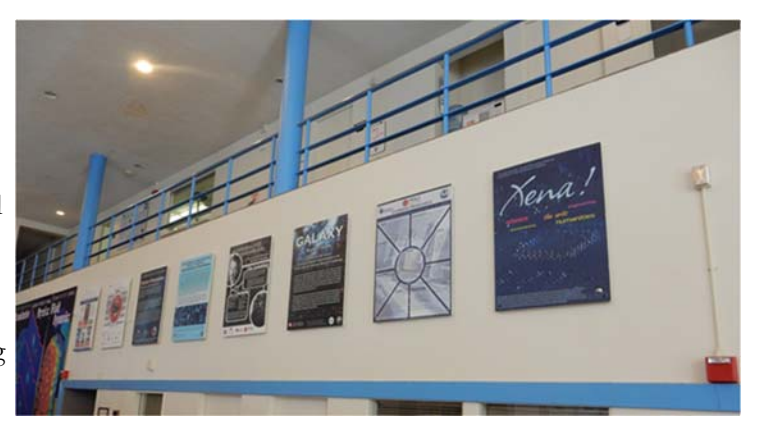
Supercomputing conference posters hung by Mikel Matic and Oralia Nuñez in Area 4

I am writing to express my acknowledgement and sincere thanks to Mikel Matic, Area 4 Facilities Services Technician, for his exceptional efforts in designing a clever, cost-effective, and beautiful hanging system for our Supercomputing '14 and '15 conference posters on the 'main showroom floor' of our Center [CARC]. Once I approved the design and materials purchase by CARC, Mikel quickly implemented his design (including mounting and installation with the able assistance of Oralia Nuñez) and we are receiving many compliments from visitors on the elegant display. Most of these posters had been sitting sadly on the floor for over a year, propped against office doors, and Mikel's system simply perfect— and finally does them justice.